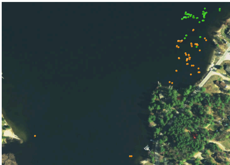
E Shoreline and Bay, E of channel, Brant Lake